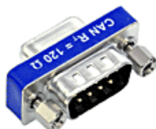
Picture 4-1: CAN bus termination resistor 1.04.0075.03000

There is no bus termination resistor for the CAN bus in the CAN interface integrated. HMS offers a bus termination resistor as a feed through connector as accessory (order number 1.04.0075.03000)