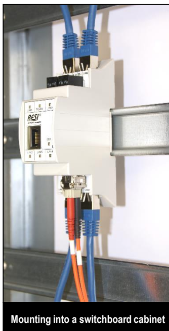
Mounting into a switchboard cabinet

Unmanaged switch with 5 Ethernet ports with 1GB and one SFP port with 1GB for connection of optical fiber cable, ideal for home and building automation tasks. Each LAN port has its own LED status. The switch is designed to suit into the 45mm slot of a standard electric switchboard cabinet. Power supply is done by two removable plugs. Weight: 120g, Dimension (LxWxH): 35x110x60mm, Power supply: 12-48V= with two removable plugs, Power consumption: <1.5W, Mountable onto a EN50022 DIN rail or directly to a wall.