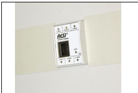
Build into a 45mm slot