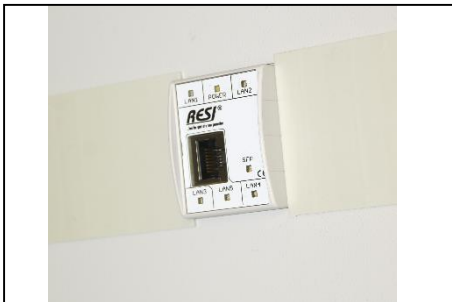
Build into a 45mm slot