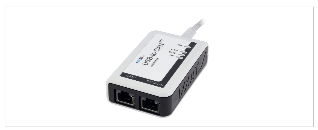
Fig. 2 USB-to-CANFD automotive