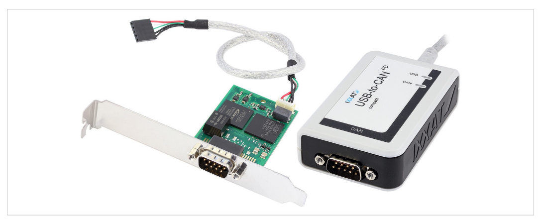
Fig. 1 USB-to-CANFD embedded and compact (Sub-D9)