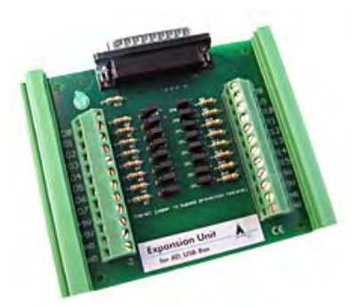
Expansion Unit for AD_USB-Box (scope of supply)

The AD_USB-Box provides 8 single-ended or 4 differential analog inputs respectively, and 4 digital inputs. Additional 16 digital inputs are available by connecting the Expansion Unit, which is included. The inputs of the Expansion Unit are extra protected against short circuit and surge.