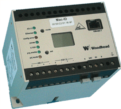
- AS-Interface gateways -