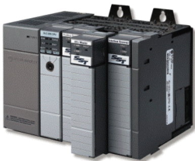
- AS-Interface for A-B SLC -