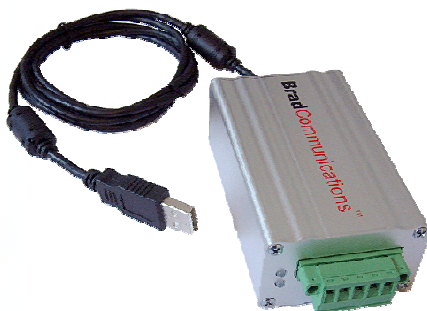
USB v2.0 Adapter Development Kit