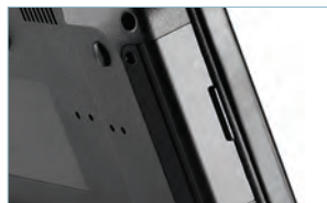
Swappable Storage Tray