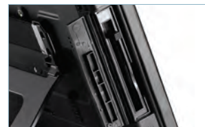
Expansion Slots (PCMCIA & SD)