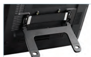
Hand Strap & Kick Stand