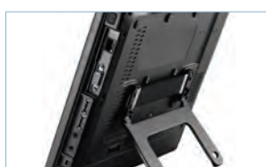
Input & Output Ports