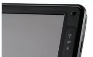
Rubber Ring & LED