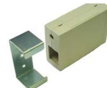
Surface Mount Clip