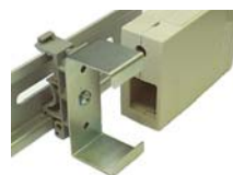
DIN Rail Clip