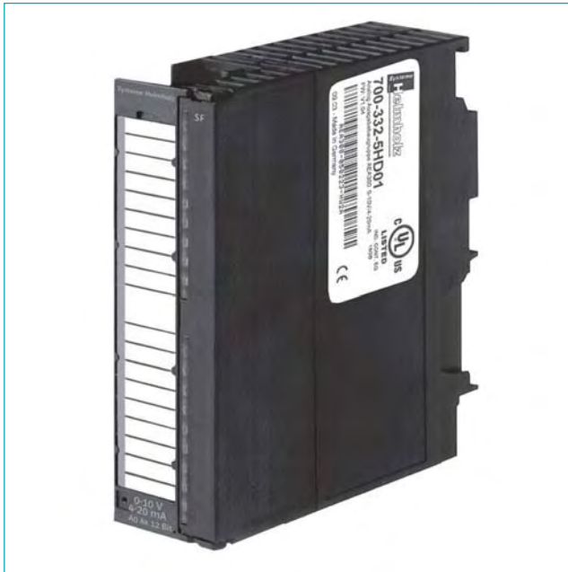
4-channel analog output module

The analog output modules from the Systeme Helmholtz GmbH convert the internal signal level of the programmable controllers to the analog signal level required for the process.