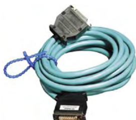
Connection cable Multiplexer – PLC TTY