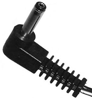
Fig. 1 – Supply connector 3,8 x 1,3 mm