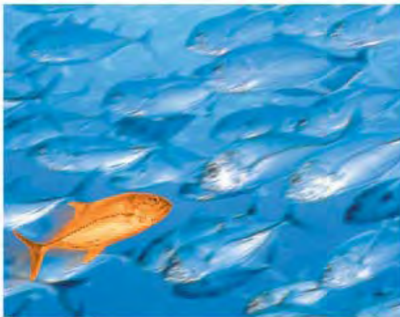
Multi Point Interface Controller